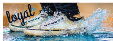
Loyal Splash Pad