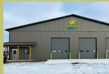
K&S Performance & Repair LLC, Stanley