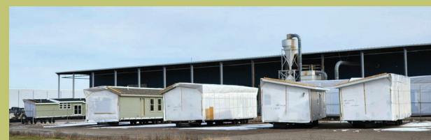
MidCountry Homes: Factory-built homes