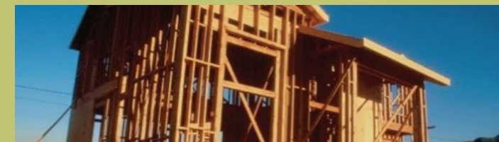
Home Builders: Built on site