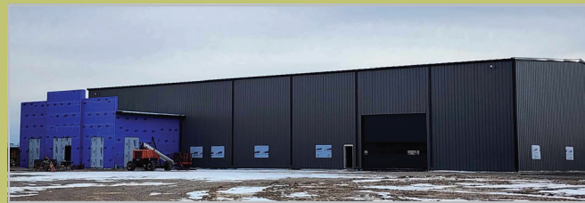
Metal Wholesale LLC, Owen