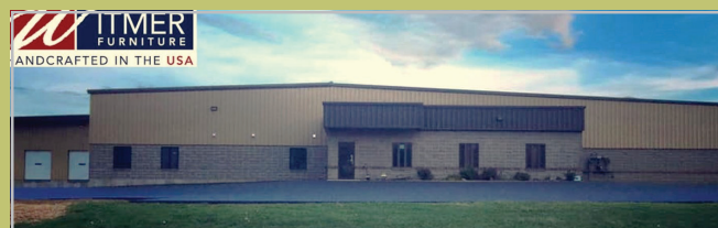
Witmer Furniture, Abbotsford