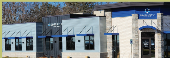
Simplicity Credit Union, Neillville