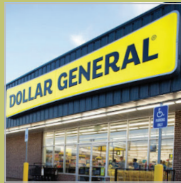
Dollar General, Granton