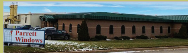
Parrett Windows & Doors, Dorchester